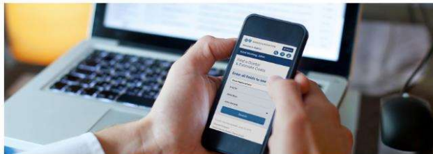
Finding Care: learn about our other tools and resources available to you.