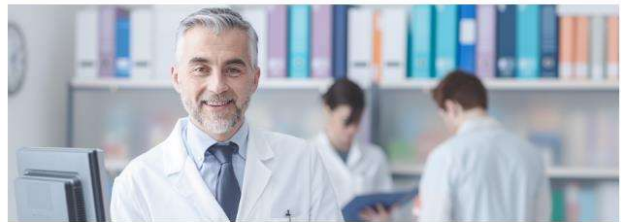
Talk to a Doctor Now: On-demand interactive medical professional consultations available.

To get accurate results, you will want to first enter the name of the doctor or, for a list, type in an office. For example, “Family Medical Physician” (or the specialty in which you are looking for). Next, you will want to input the location, for this it is suggested to enter a zip code rather than a city for most accurate results. Lastly, you will want to select “PPO or EPO” from the drop-down menu in the “Select a Network” section of the search function. From here you will click “Search”.